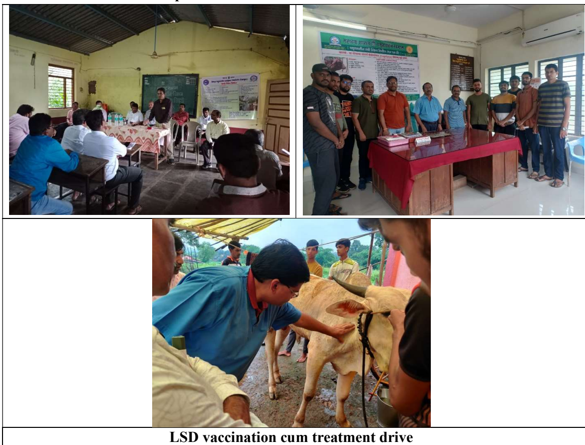
LSD vaccination cum treatment drive