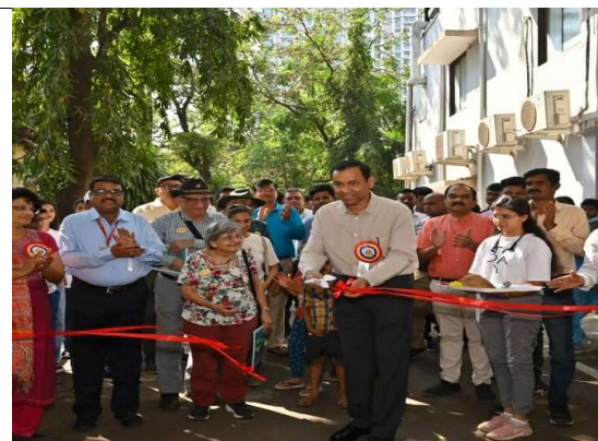
Inauguration of 252nd and 253rd Breed Championship Dog Show by the hands of