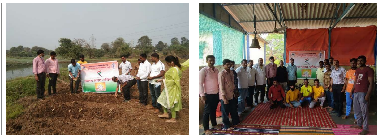
Activities in adopted villages

FURNISH DETAILS ACTIVITIES IN ADOPTED VILLAGE IN ANNEXURE-XVIII