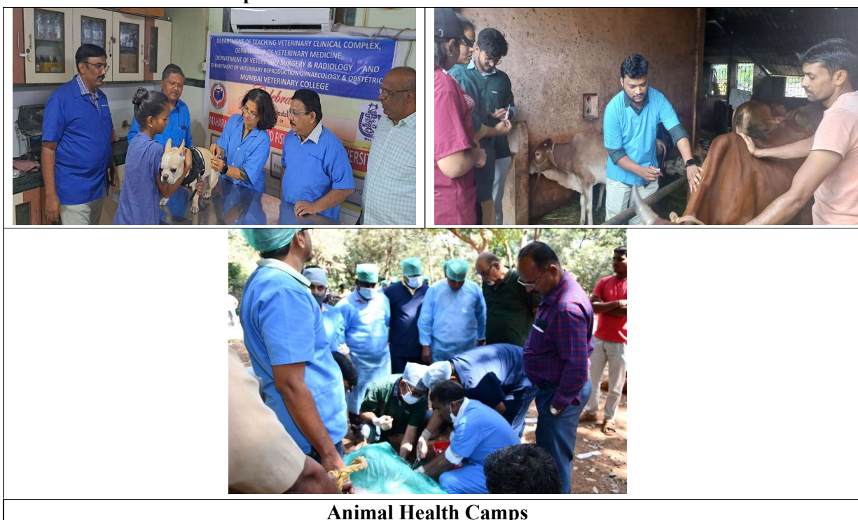
Animal Health Camps